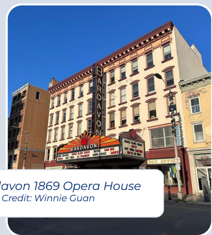
Bardavon 1869 Opera House