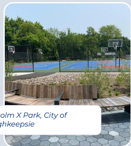
Malcolm X Park, City of Poughkeepsie